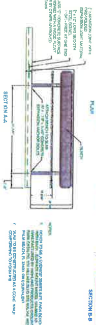
PARK BENCH W/CONCRETE SLAB (NOT TO SCALE)