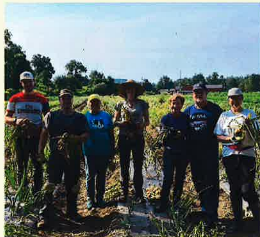
Thank you to the volunteer farmers who helped with our onion and garlic harvests. With our community helpers, it took less than an hour to harvest thousands of garlic bulbs!