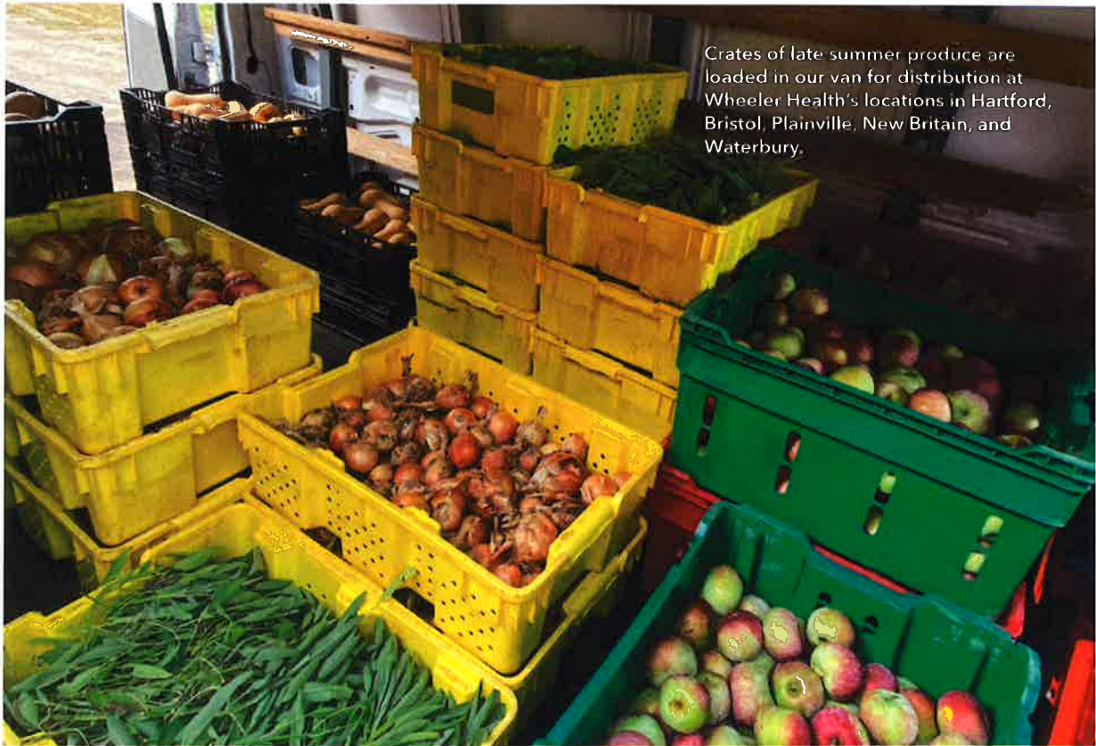
Crates of late summer produce are loaded in our van for distribution at Wheeler Health's locations in Hartford, Bristol, Plainville, New Britain, and Waterbury.