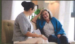
Caregiver Support Groups Community Café