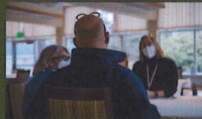
Adult Day Program