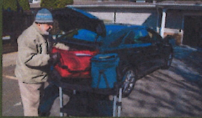
Meals on Wheels